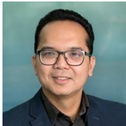
Romulae R Gadaoni

April 2026 was a month of stark contrasts across financial markets, with Wall Street posting its strongest monthly performance since November 2020 while Australian investors navigated a more turbulent path shaped by oil price volatility, geopolitical anxiety, and a domestic rate environment that only tightened further. The S&P 500 surged more than 9%, powered by a blockbuster corporate earnings season and the relentless momentum of AI-driven spending, while the ASX 200 clawed back a modest gain after giving up most of a mid-month rally. On the ground, Australia's property market continued to fragment along geographic lines, with Perth, Brisbane, and Adelaide pushing higher as Sydney and Melbourne softened. And this morning, the Reserve Bank delivered a third consecutive rate rise, lifting the cash rate to 4.35% in an 8–1 vote, as the Middle East conflict keeps fuel prices elevated and inflation stubbornly above target.